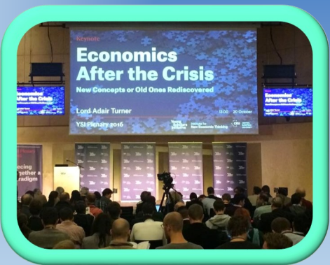
Conference on new economic thinking in Budapest