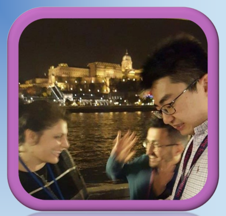
At a post-conference dinner on the Danube River with fellow conference presenters and participants with the Buda Castle in background!