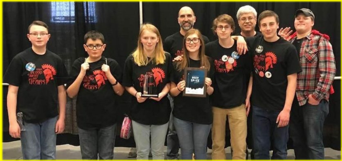
Edmeston high school team - FIRST Robotics Team 5585, nicknamed "Blood, Sweat & Gears"

now an administrator with the much larger Voochreesville school district near Albany, he promptly sent a generous check to help fund the Edmeston team's upcoming trip to Detroit.