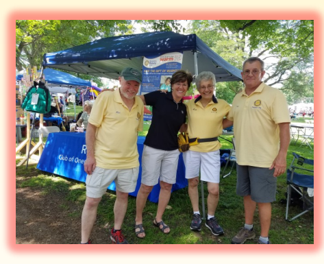
The Oneonta Rotary

Oneonta Rotarians at the Scratch Off Madness booth at Oneonta's 4th of July in the Park