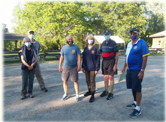
Concern for others...when close, wear your mask!

Our District's ' 7 Runs, 7 Counties, 7 Days ' series of events raised $4,027 for Polio Plus. About 45 Rotarians, from 14 of our District's 44 clubs, participated by walking, running, setting up, or donating, during the 7 consecutive days from June 21 st thru 27 th . These funds will be matched 2:1 by the Bill and Melinda Gated Foundation for a total of $12,081!