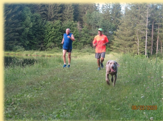
...as are dogs!