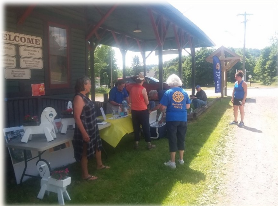
Rotarians pitching in to get ready