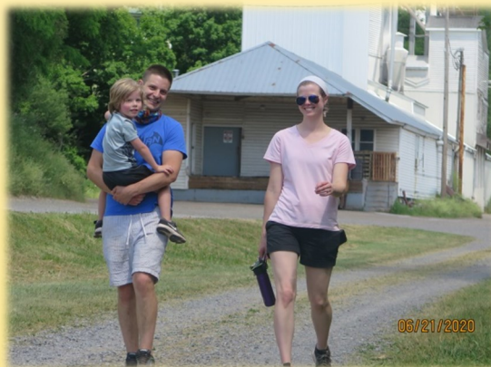
Families are a big part of Rotary...

So start planning for 2021 and let's make the list of participating club's too long to print!