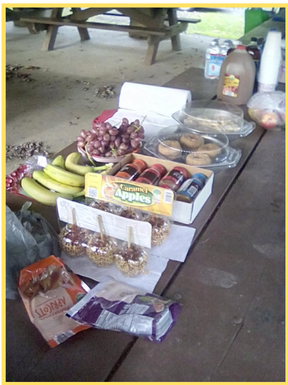
Food for the workers

The cleanup effort is done by communities all along the Susquehanna River Watershed and it makes a BIG difference in keeping the Chesapeake Bay clean. Thank you, Nimmonsburg Rotary for doing YOUR part!!