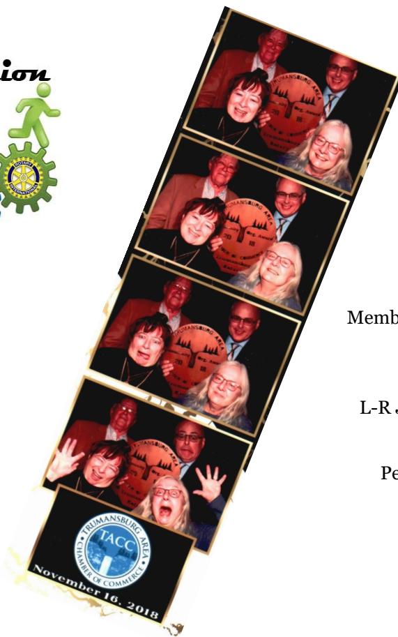
Members of the Trumansburg Rotary Celebrate their award!!