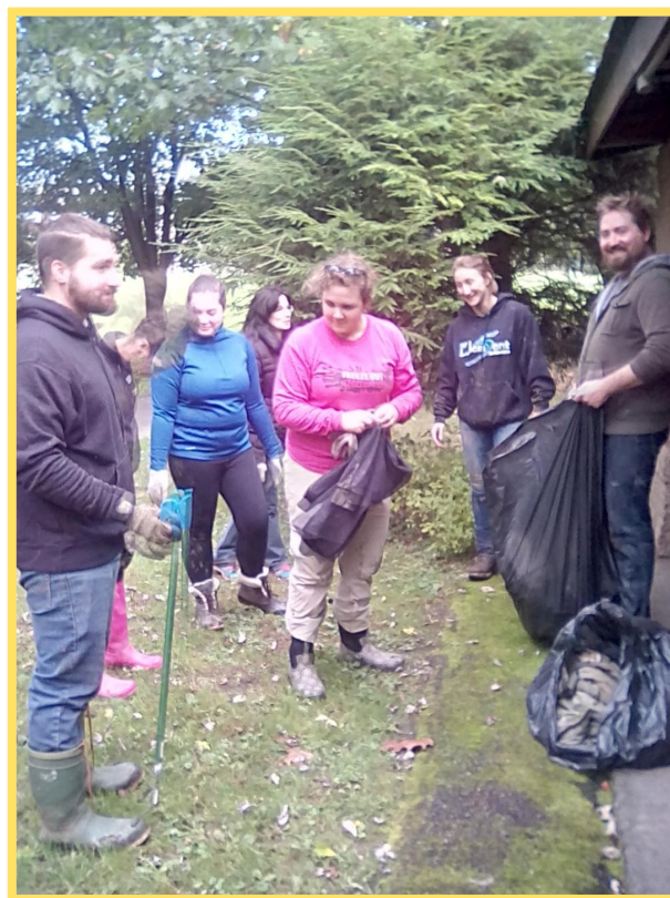
A few members of the cleanup crew