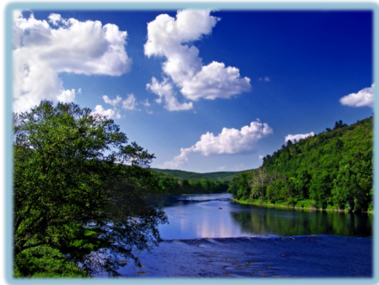
Upper Delaware River