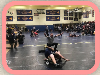
Tournament in full swing