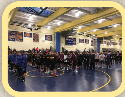
Sixteen teams waiting