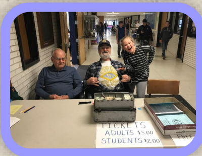
Get your tickets