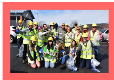
Obviously, we didn't listen to the safety lecture. (No Rotarians were harmed during this event!)