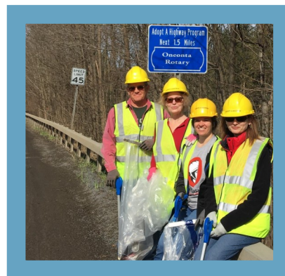
Doesn't this road look nice?!