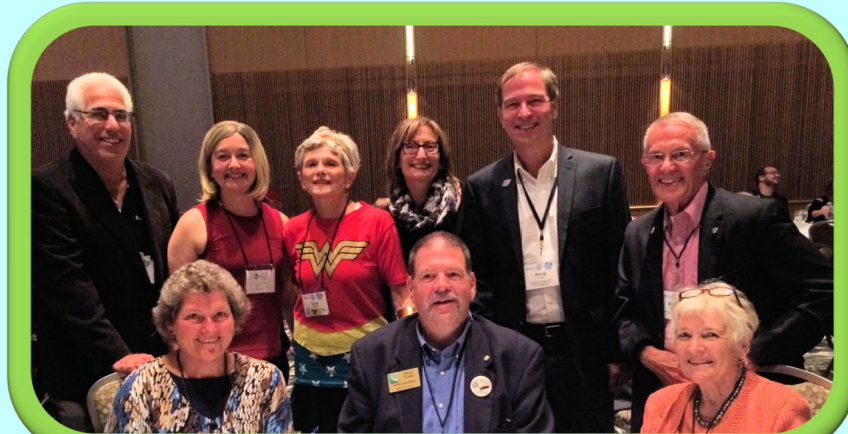
Zone 28 29 Super hero night District 7170