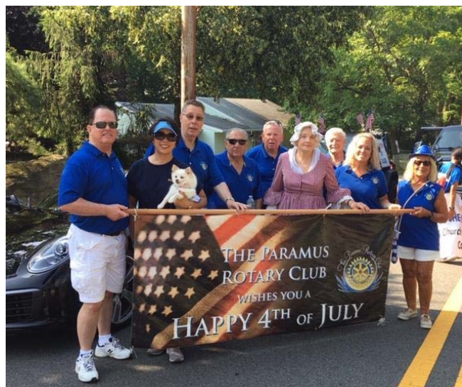
Members of the Paramus Rotary Club prepare to march in Paramus' annual Independence Day parade on July 4.