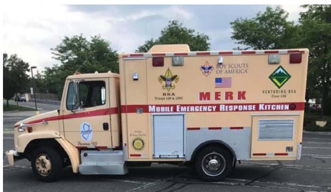
The Paramus Rotary Club was a major contributor to the Paramus Boy Scouts Of America Troop & Venture Crew 138 for the purchase of their MERK truck. On July 4 th it was used by the troop as they prepared 200 breakfast sandwiches for the Paramus's Finest First Responders.