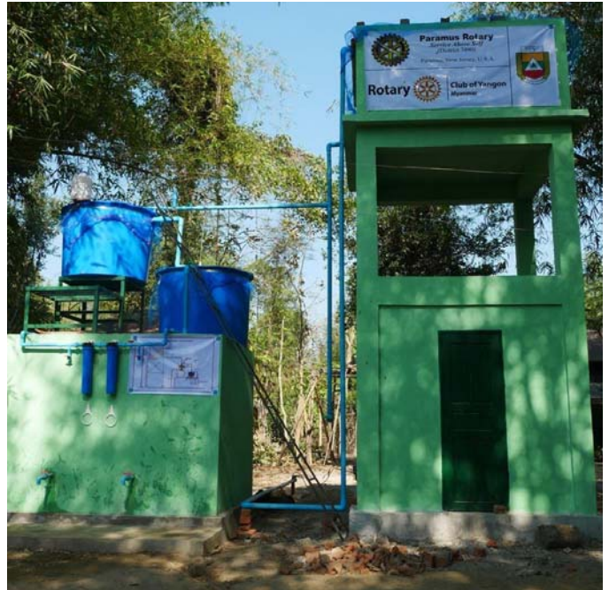
The water tower near Yangon, Myanmar. Atop the water well is a banner highlighting the Paramus Rotary Club and the Rotary Club of Yangon, both of which worked on the project.

Drinking water contaminated with human waste is a known cause of Polio, and the Centers for Disease Control & Prevention now recommends that all visitors entering Myanmar be vaccinated for Polio prior to entry.