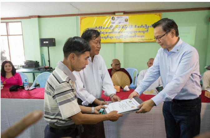
As the transfer took place, members of the audience chanted blessings.