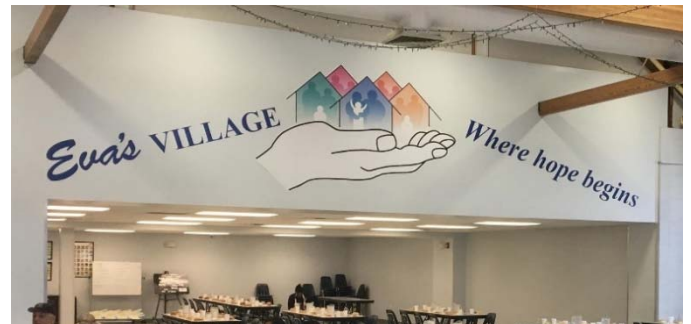
The motto of Eva's Village in Paramus – Where Hope Begins – greets guests who are served every day of the year, including – and especially – holidays, where people who could be with their own families, instead are ready to serve their neighbors in need.