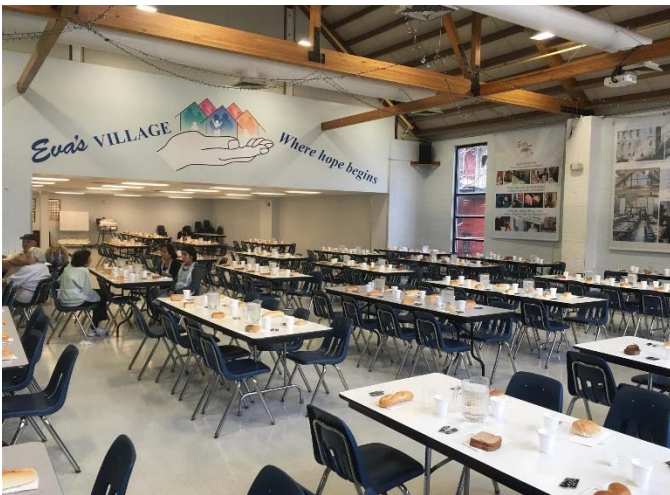
To the left in this picture are members of the Paramus Rotary Club ready to serve lunch at Eva's Village to people in need.