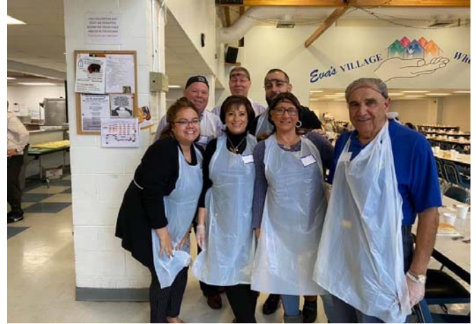
Some of the members of the Paramus Rotary Club who served meals to people in need at Eva's Village in Paramus.

Eva's Village was founded in 1982 at the height of a recession, when according to its website: "there were few services available to people who were struggling with hunger and homelessness in Northern NJ."