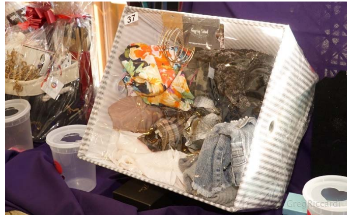
Some of the tricky-tray items on display at the Paramus Rotary Club's brunch on Feb. 10.