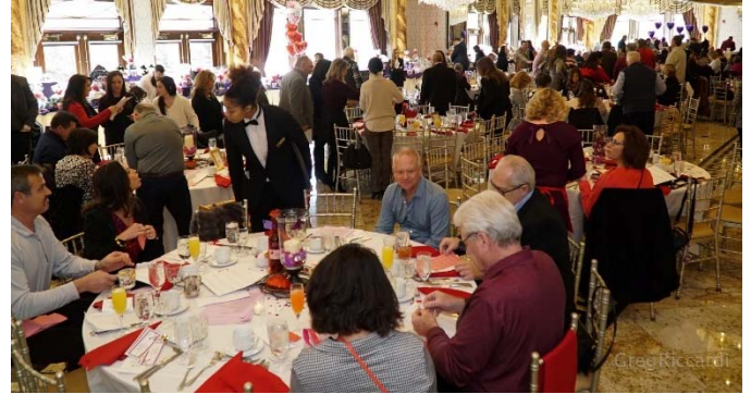
Members and guest of the Paramus Rotary Club at their brunch on Feb. 10.