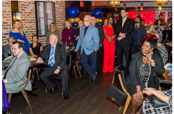
Members and Guests of the Jersey city Golden Door Rotary Club during the club's charter ceremony on March 15.