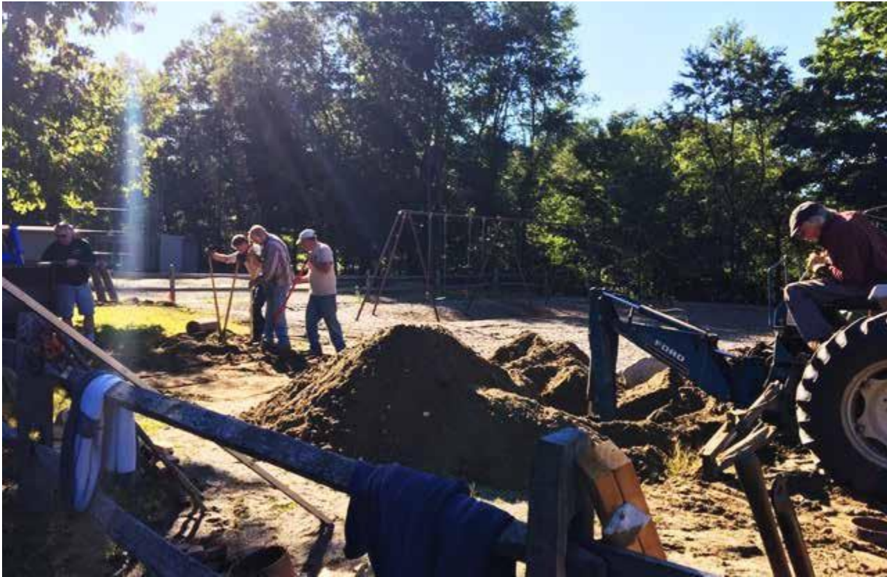
Rotary Club volunteers dig holes for footings at the soon-to-be finished Harmony Park project at the Randolph recreation field.