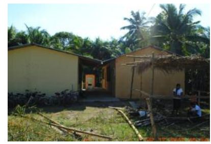
The Tres de Mayo School

women's health clinics, dental clinics, and fluoride clinics for the children. Dozens of women received breast and