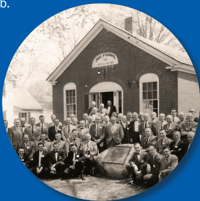
Paul Harris visits The Wallingford Memorial Rotary Club in 1933 when it was dedicated as "The Little Red Schoolhouse."

Today, the Schoolhouse acts as a historic site that stores and displays Paul Harris memorabilia and is the meeting place of the Wallingford Memorial Rotary Club.