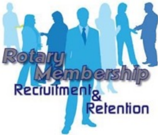
Membership History Report