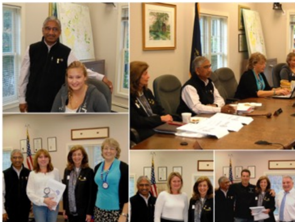
Visits by the Rotary District Governor and a former Rotary Youth Exchange student, plus the induction of three new members, make the October 14 th meeting a special one!”