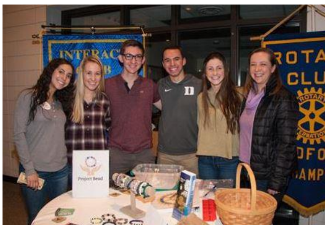
Picture 3 At the annual Idol Contest, the Interact Club of Bedford HS raises money by conducting a 50/50 raffle.