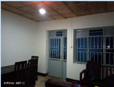
Left: Interior lighting where it was previously dark at night. Right: Exterior solar pole light