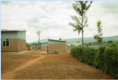
Left: RCEF housing units Right: Roof solar panel on top of each housing unit

*Some of the clubs’ donations were matched with District Matching Grants.