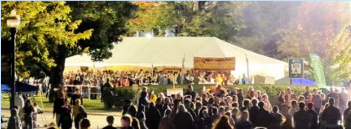
Friday Night 6:45PM looking from The Milford Oval towards the BWS Tasting Tent – The Crowds were huge!

As always we are extremely grateful to our venue and activity sponsors! Please consider joining us for some fun next year as a visitor, sponsor or volunteer on October 6 th , 7 th & 8 th , 2023. For more information please email milfordlionsrotary@gmail.com .