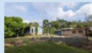
PHOTO: Amigos to Honduras School Construction site south of Danli

This amazing group of young people have decided to provide $2,000USD of funding to purchase needed laptop computers for the Del Sola School just south of the city of Danli Honduras. As the District prepares for our next trip of the "Amigos de Honduras," my Team is putting together the organization needed to get this much desired equipment to the children at the rural school as a meaningful gift from our caring Students in Nashua, NH USA. As a trip participant on the last Amigo's de Honduras trip I heard numerous times how these computers would benefit the less fortunate children we met. Well done, Nashua South Interact!