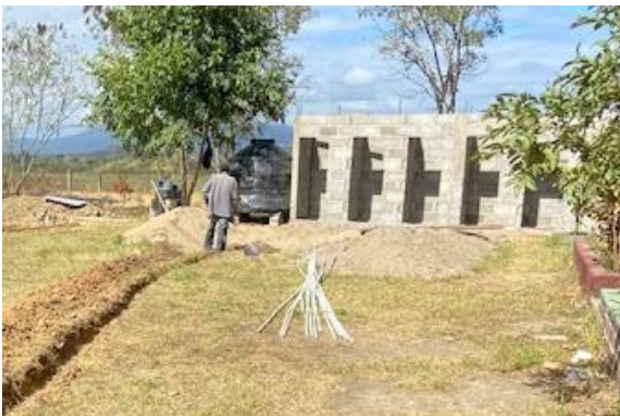
Four new Latrines and a Cistern