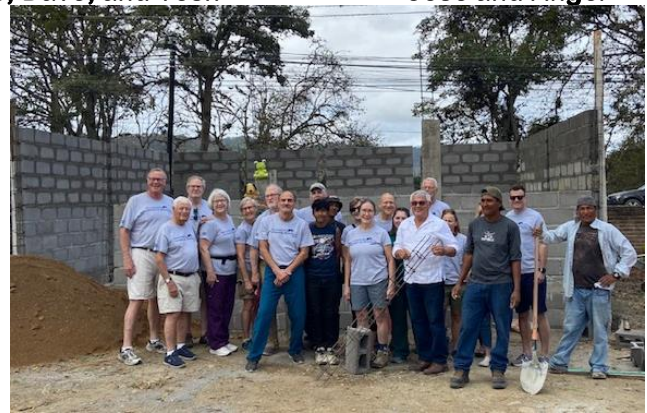
The entire team visited the morning of day 6