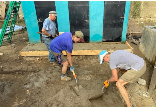
Rehabbing three Latrines