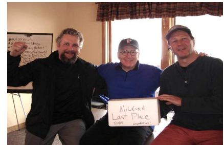
Last Place Winners - Milford Rotary Club

And the Milford team left saying that maybe they should go to Chili for training before next year! Good luck guys.