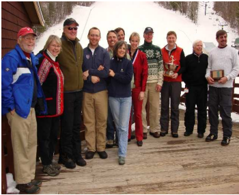
Fellowship Award – Woodstock Rotary Club

Woodstock also won the Fellowship Award for most members from the club attending with 13.