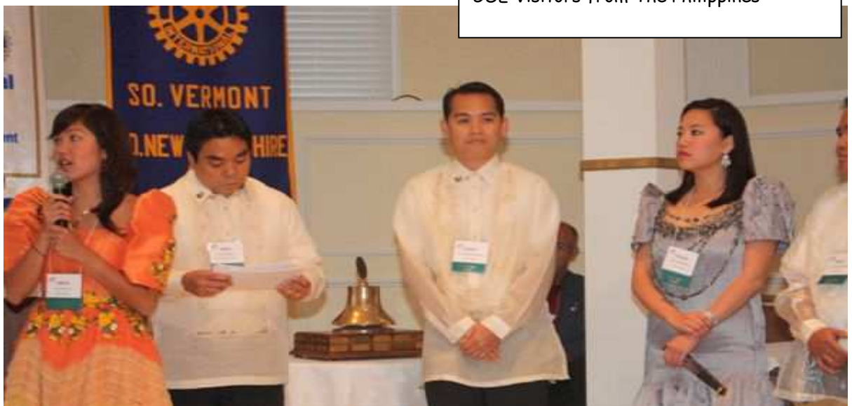
GSE Visitors from The Philippines