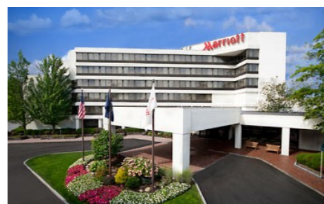
Sable Oaks Marriott in Portland, Maine

Owned by the potential buyer of the Balsams, we will enjoy the same high quality of service, excellent food, and great conference facilities. There is an indoor swimming pool and whirlpool with an outdoor patio and two fitness centers. Saturday afternoon, you can play golf, enjoy the old port or drive 20 minutes to shop at L.L. Bean in Freeport. Reservations open in December.. Watch for it on the District website.