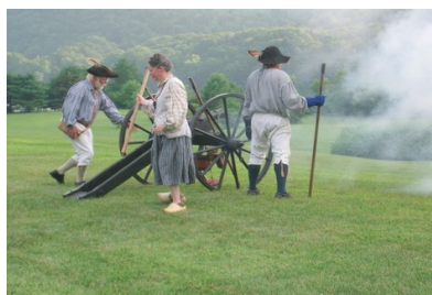
Firing the Old Cannon