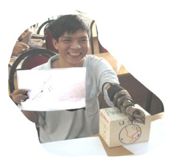
"I can draw now!"

To learn more about the prosthetic hand, go to: <a href="https://www.LN-4.org">www.LN-4.org</a>