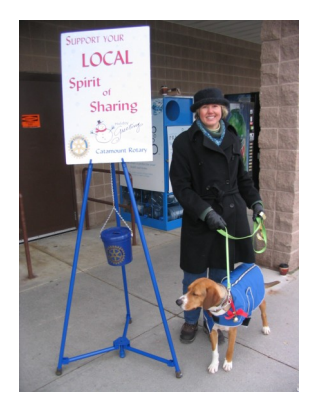
Bennington-Catamount Member and Friend Ring the Bell for Food and Fuel