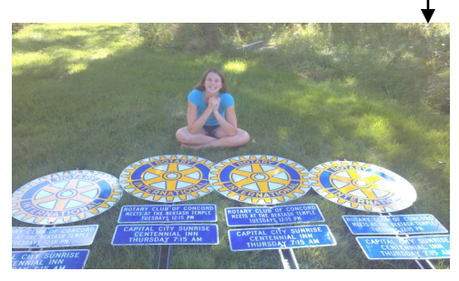
An Eagle Scout project by a Concord Rotarian's Son