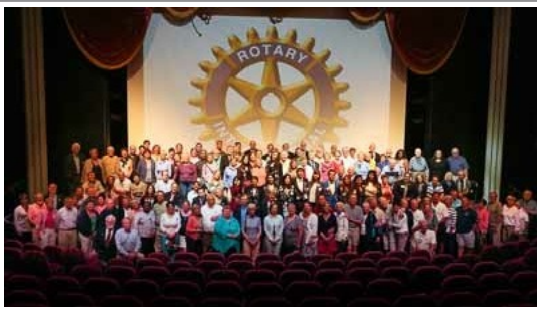
Two hundred and three intrepid souls from Rotary Districts 7850 and 7870 set forth aboard the Norwegian Dawn on May 24th for a week's cruise. The photo shows the assembled group in the Starlight theater aboard.