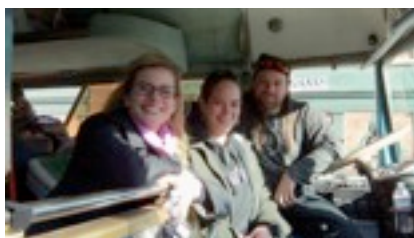
Bennington Bus Delivery Team.

collection point in Paramus, New Jersey. The wealth of clothing became a 48,000 lb. donation to the New Jersey Salvation Army. When the word came down in our District, our used clothing was diverted as a donation to the Salvation Army so as not to ship it South where it wasn't needed.