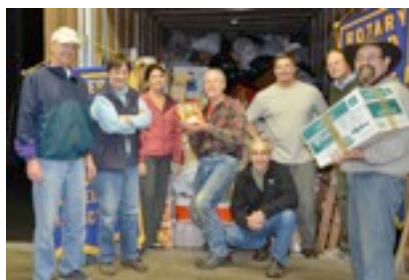
Brattleboro Collections Team.

Sensitized by tropical storm Irene in 2011, the Rotarians of our District performed magnificently in the effort to provide the 6 Districts in New York and New Jersey stricken by Hurricane Sandy with much needed supplies of food, clothing, water and everyday living supplies.