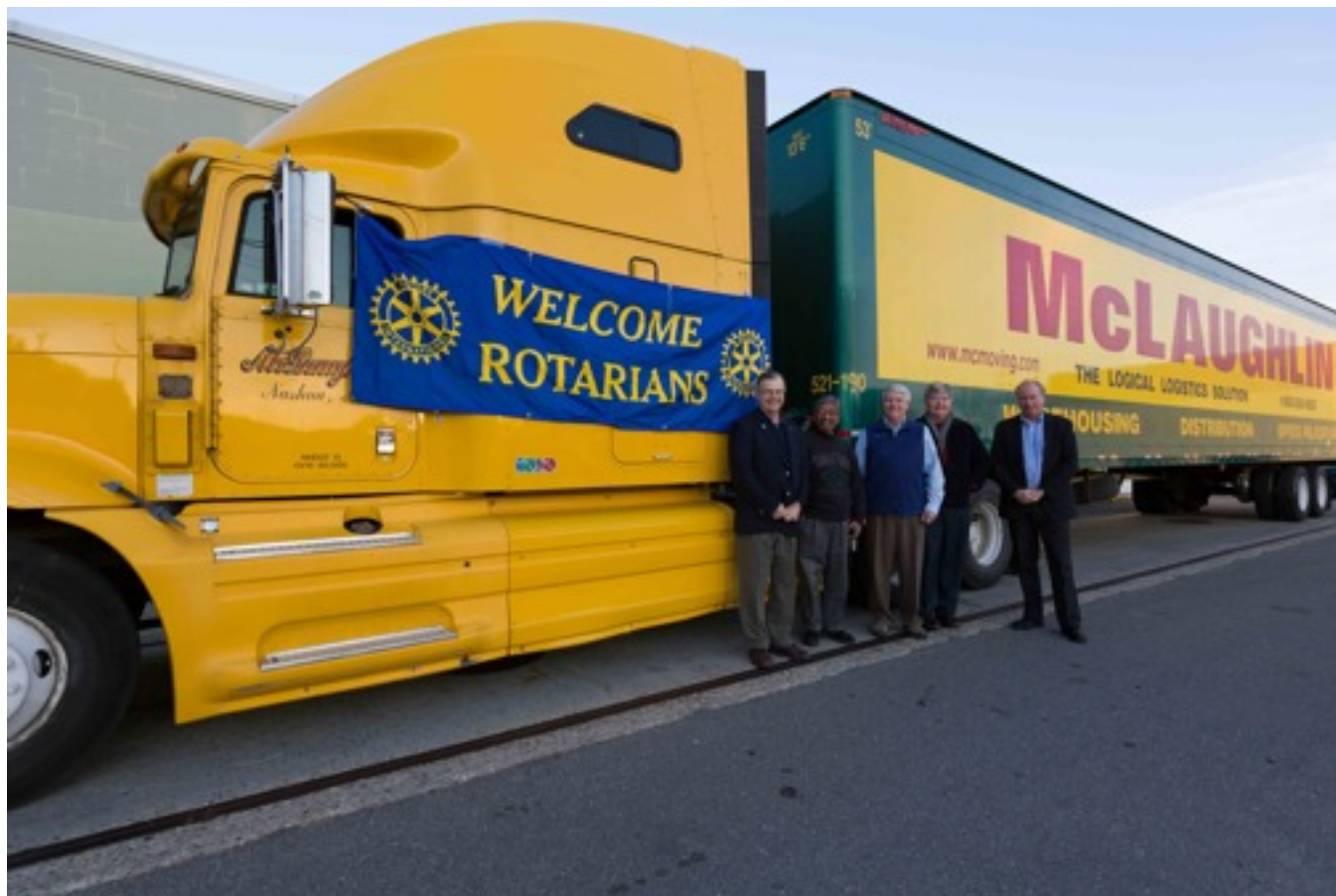
NH Truck to NY/NJ