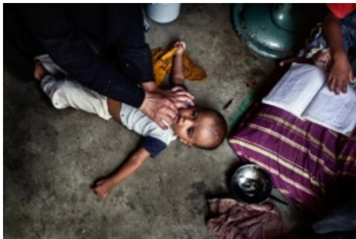
A child received a polio vaccine in a volatile neighborhood on the outskirts of Karachi, Pakistan.

“But I told her,” he said. “If a man has to die, he can die even at home. I’m going back to work.”