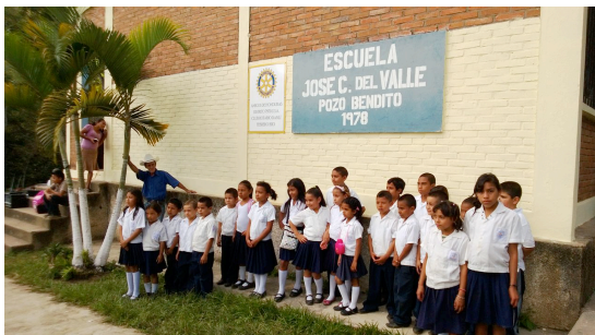
Celebration of School Repairs at El Pozo Bendito