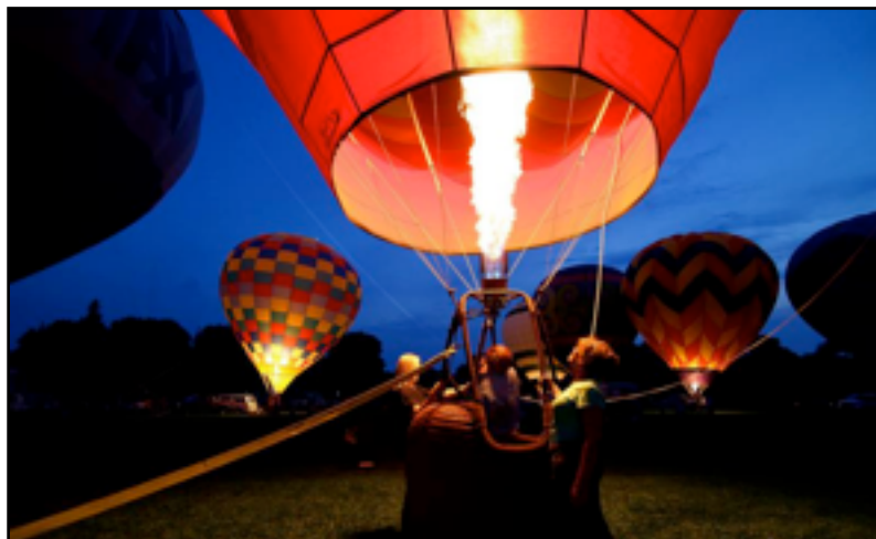
Hot Air Balloon Rally