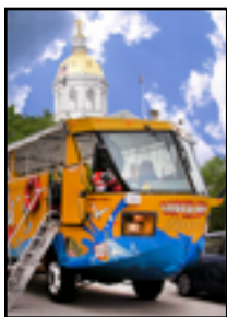
Super Tours Duck Boat