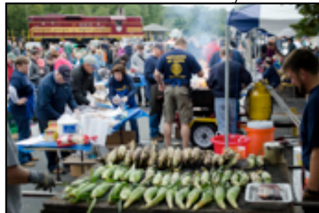
Glory Days of the Railroad