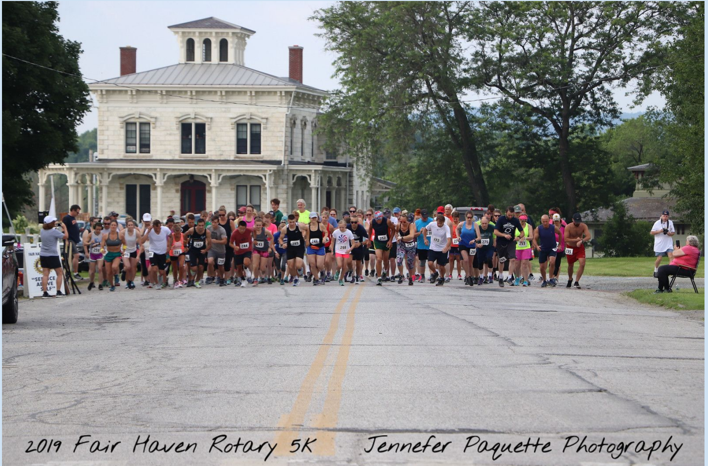
2019 Fair Haven Rotary 5K

It was a great community event and we can't do it without great community members like all of you! Thank you again from a very grateful Fair Haven Rotary Club!