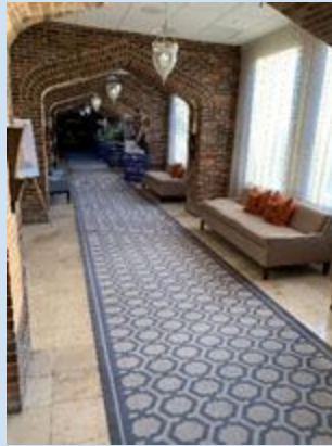
Framingham NEPETS 2019