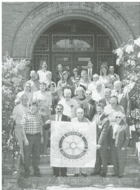
Ludlow Rotary Club June 2002