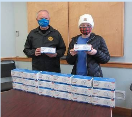
Rotary 1,000 Masks