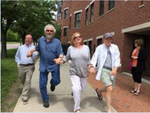
Burlington District Conference 2018 - It's spring and we're almost free!