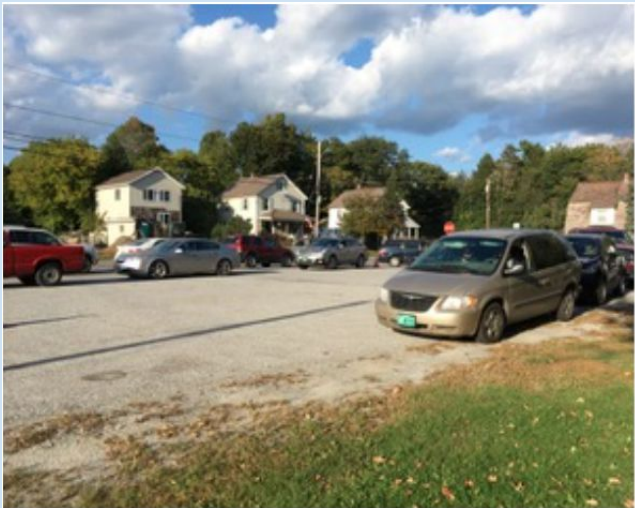
Caption: Cars line up at Young at Heart Senior Center.

The Rutland County area hub works through Vermont Farmers Food Center and the community of Poultney has a satellite location at the Young at Heart Senior Center serving meals on a first come, first served basis each Wednesday starting at 5 pm. As People of Action Poultney Rotary has teamed up with the project since September and will continue in the coming months to provide assistance to lessen the impact of food insecurity. The most recent distribution provided 100 meals.