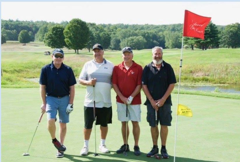
2nd Place Milford Non-Rotary Team