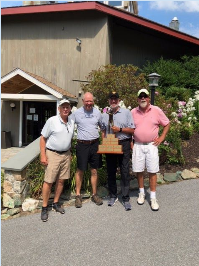
1st Place Winners from Deerfield Valley with District Golf Trophy