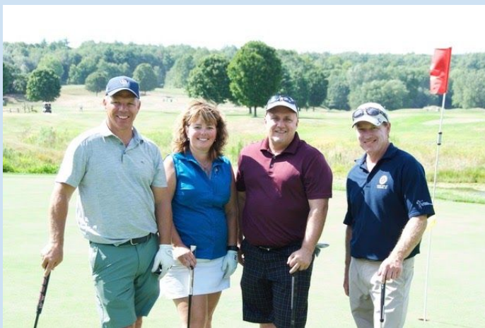
3rd Place Concord Rotary Team