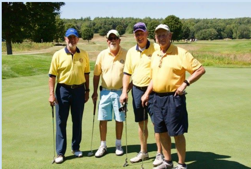
Winning Team from Deerfield Valley