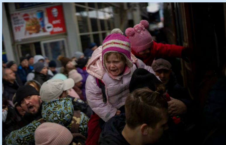
Caption to attached photo: credit Emilio Morenatti/AP

Thomson added that “We genuinely hope we can support the desperate needs of the folks in the Ukraine who are hungry and suffering the personal and family deprivations resulting from this terrible invasion. So let’s ‘Eat So Others Can Eat!’”