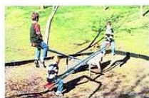
4 Seater See-Saw