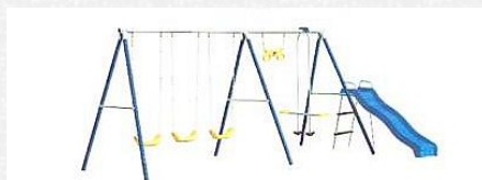
Swing & Slide Set