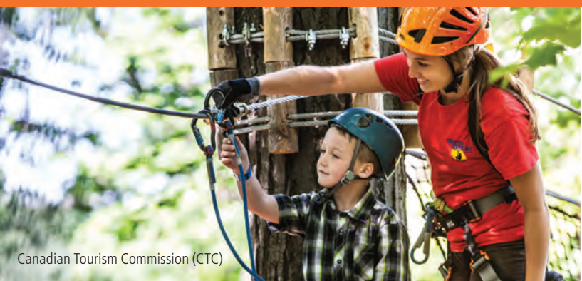
Canadian Tourism Commission (CTC)

Plan for additional days of travel before and after the convention so you can bask in the beauty, majesty, and relaxation that await a short flight or drive away.