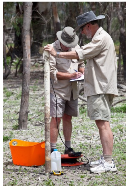
Rotarians performing water quality testing

Including Calperum into your club program provides new opportunities and experiences.