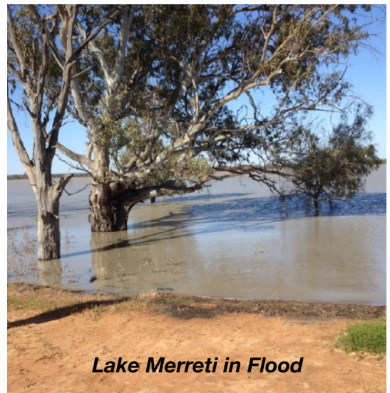
Lake Merreti in Flood