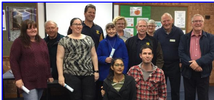
Above are the Graduates of the Course.