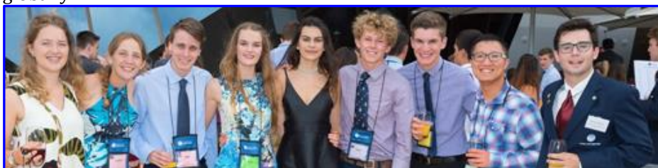
NYSF Graduates at Science Dinner, January 2017

I look forward to continuing to be an ambassador for Rotary and Rotaract and being part of the positive change Rotary has on communities locally and globally.