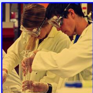
The National Youth Science Forum will open doors these participants never dreamed of.