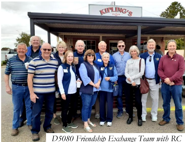
D5080 Friendship Exchange Team with Maitland Team at Port Wakefield

Maitland - Wednesday 23 to Sunday 27 October