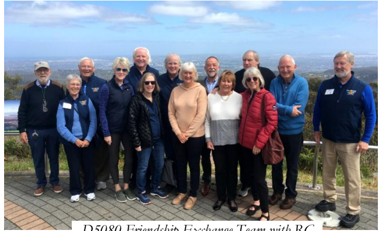
D5080 Friendship Exchange Team with RC Regency Park Hosts at Mount Lofty

Maitland - Wednesday 23 to Sunday 27 October