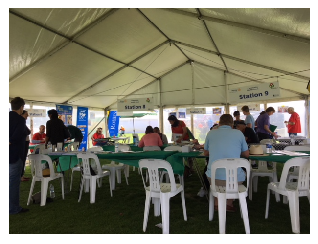
Inside the marquee

RC Prospect conducted a "Health Check Day" recently at the relocated Prospect Fair on Broadview Oval – moved from March to October and from St Helens Park to Broadview Oval. This was a highly successful day with over 130 people – Men and Women, were given a health check via 9 check points including a final review by Doctors – great effort by all.