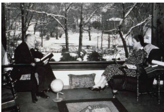
Paul Harris and his wife in their house at 10856 S Longwood Drive Ridge.