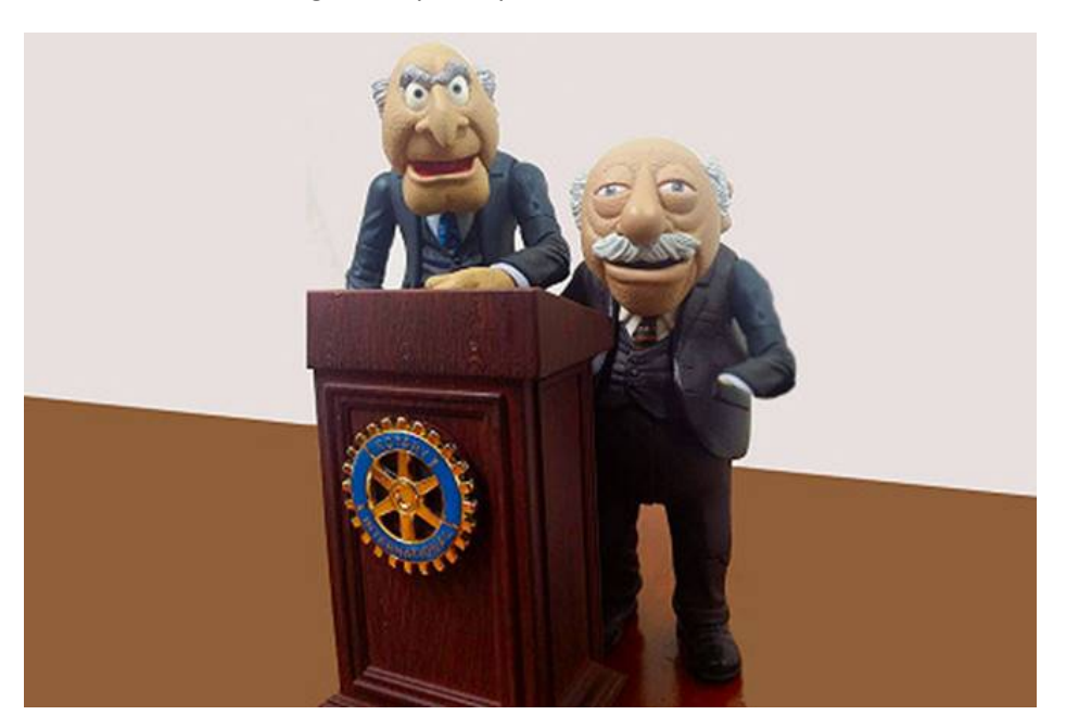
Which Club are these guys from?? Surely not one in 9500! They look like future, current (or past) District Governors, if you ask me? ③

Too good to pass up to have another shot?