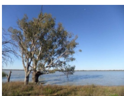
Lake Merriti, Calperum

For more than 20 years, South Australian Rotarians have been environmental volunteers at Calperum, a former sheep station located a short drive north of Renmark in the South Australia Riverland, now managed by the Australian Landscape Trust. Over time Calperum has become Rotary's biggest environmental project!