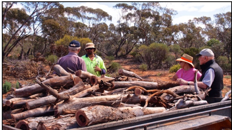
Loading cut Mallee timber from a recently made fire break