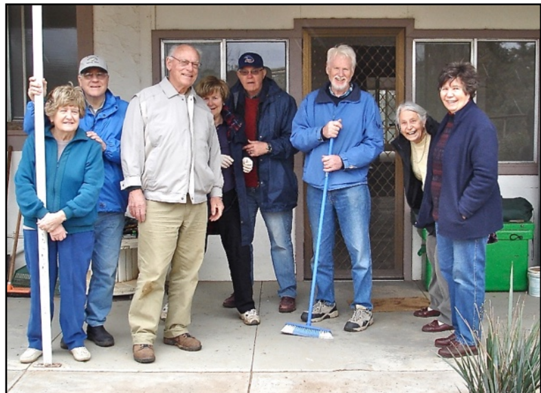
Blackwood & Norwood Rotarians outside Rotary House