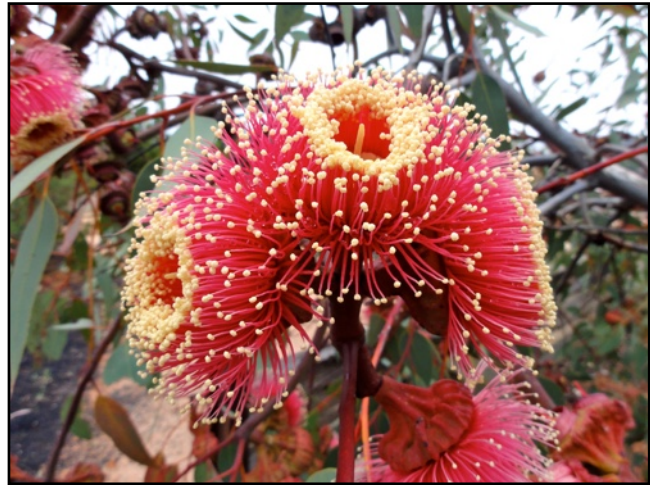
Beautiful flowering gum near the headquarter's main

The main environmental thrust of Rotary began when R.I. President, Paulo Costa, conceived the idea of "Preserve Planet Earth" in 1990 with the object of promoting awareness amongst Rotary Clubs and Rotarians of environmental issues and to increase the number of environmental projects undertaken by Rotary Clubs. Preserve Planet Earth (PPE) became a Joint District Committee with the involvement of Districts 9520 and 9500 and interest in environmental issues within these districts was expanded with the "Rotary's Native Bird Nestbox" (ROBIN) program and Australian Campaign for Rabbit Eradication (ACRE) program.