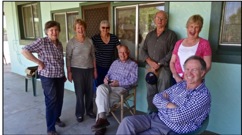
Blackwood & Norwood Rotarians relaxing after a good day